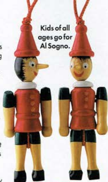
Kids of all ages go for Al Sogno.

The 58-year-old Al Sogno sweeps you away no matter what your age. Kids go wild over the giant stuffed animals; collectors ogle the porcelain dolls; motorheads admire the model Ferraris; and history buffs lose themselves in the Trojan War chess sets, each figurine in period costume down to the last buckle. Piazza Navona 53 (06-686-4198).